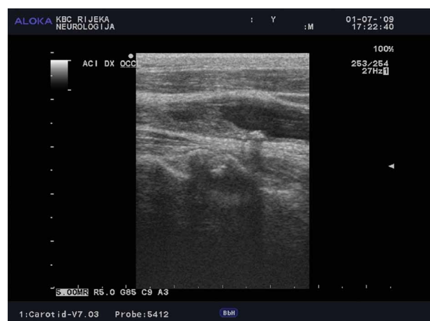
Fig. 2. Radiation-induced occlusion of internal carotid artery.