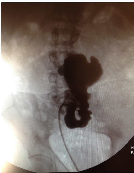
FIGURE 1. Pouchography after the creation of a reservoir.

The first operation was performed in November 2012 using a midline laparotomy approach. Because of recurrent left sided pyelonephritis, we removed the left kidney along with the ureter and removed urostomy. The right kidney and right ureter were preserved. Another part of this operation was the creation of urinary diversion for future transplantation. The small and large bowel were mobilized carefully. Preoperatively, we planned to create an ileocolonic reservoir (Mainz pouch I); however the appendix, which serves as the connection between the skin and the pouch, was too short. Therefore, we decided to perform another type of urinary diversion, Mainz pouch III. Mainz pouch III is a colonic, continent reservoir. We isolated a part of the ascending and transverse colon (approximately 35 cm) for the creation of a reservoir with adequate capacity. The operation was performed as initially described by Leissner et al (4). The right ureter was implanted in the pouch using an antireflux technique. The urinary catheter was inserted into the pouch through the umbilicus because in this type of operation the umbilicus serves as urostomy. Postoperatively, the patient developed paralytic ileus, which resolved with prokinetic drugs. The patient was instructed to irrigate the pouch regularly, twice a week, since only the right kidney produced a scarce amount of urine. This was