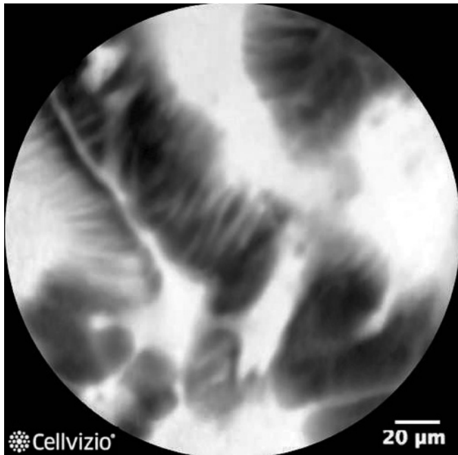
Fig. 3. Dysplasia/EAC: completely disorganized epithelium, the so-called black cells (credit: Mauna Kea Technologies). EAC, early adenocarcinoma.

in the upper and deeper mucosal layer [1, 3, 11] (shown in Fig. 3).