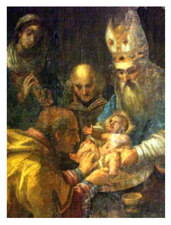
Figure 3. Circumcision of Christ. Pietro Mera (?), 17<sup>th</sup> century. Monastery of St. Katarine, Split.

Slika 3. Obrezanje Krista. Pietro Mera (?), 17. st. Samostan sv. Katarine, Split