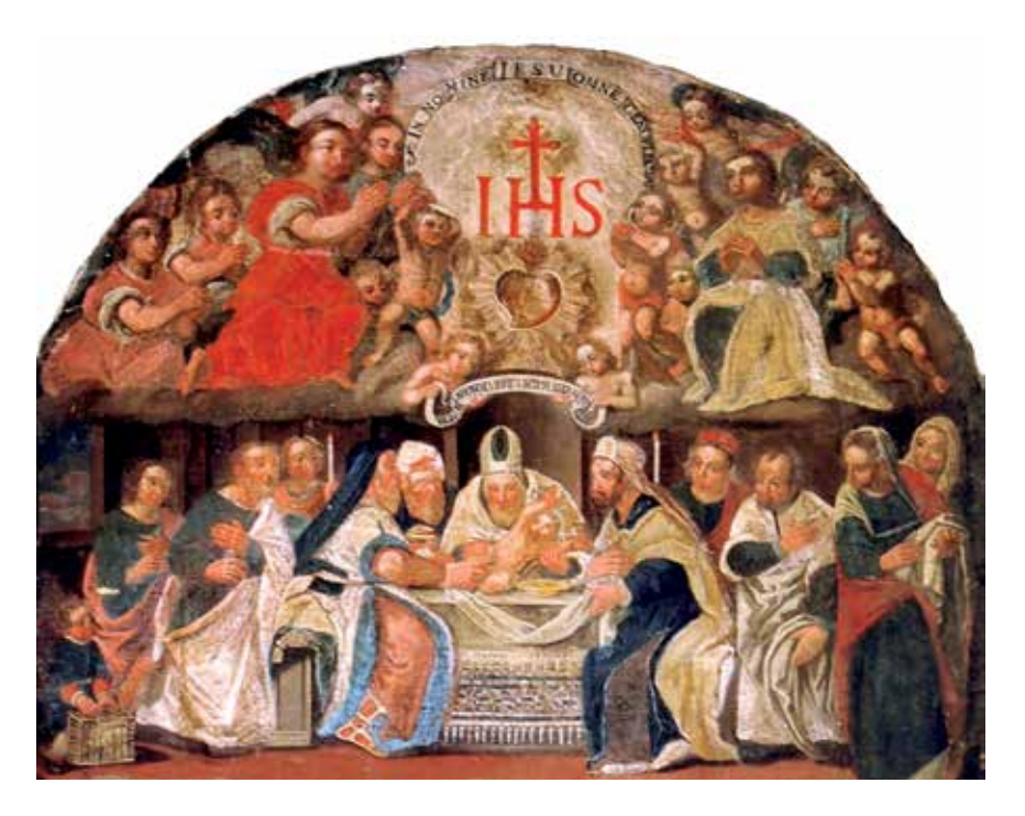
Figure 5. Circumcision of Jesus. Unknown author, 18<sup>th</sup> century. Part of the triptych Celebrating the Name of Jesus. Parish Church in the Circumcision of Christ, Labin.

Child, and the high priest prepares for the intervention with a small knife. Thanks to the number of extras and, above all, the rich staging, this presentation, as well as the entire triptych, belong to the group of younger examples in which earlier Renaissance experiences were completed. Among the presented paintings, this is certainly the most lavish, and of the world-famous reminiscent of Tintoretto's depiction of circumcision.<sup>20</sup>