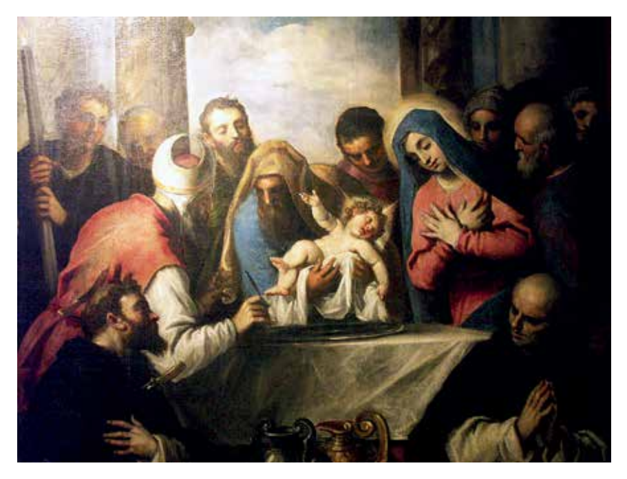
Figure 2. Circumcision of Christ, detail. Jacopo Palma Jr. 1607. Church of St. Dominika, Trogir.

elegant pruning knife. Opposite them stands Mary in prayer. In the background, there are several undefined extras, and in front, in the lower part of the picture, two Dominicans are praying devoutly.