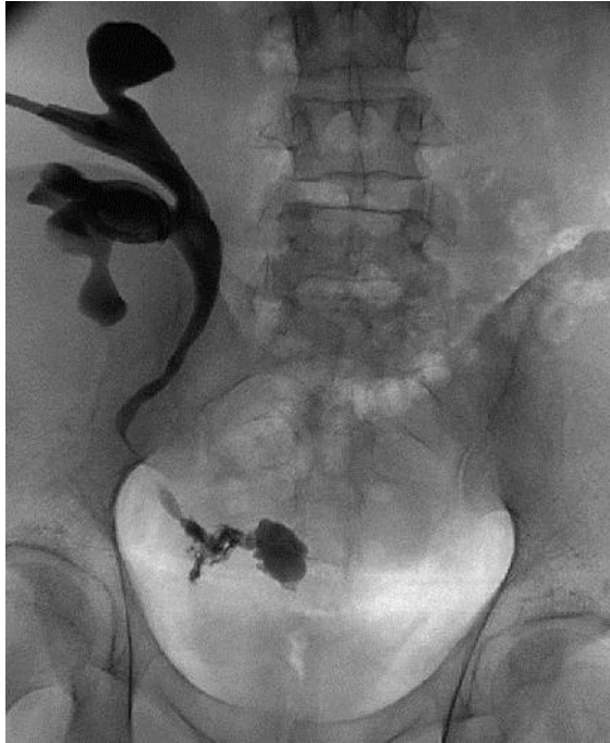
Fig. 3. Postoperative X-ray revealed stone-free graft with contrast eliminated to the bladder.

Markić et al.: Treatment of Kidney Stone in a Kidney-Transplanted Patient with Mini- Percutaneous Laser Lithotripsy: A Case Report