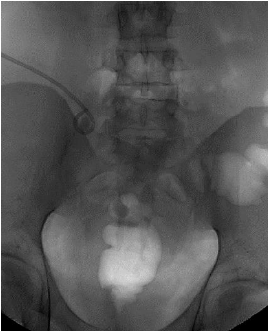
Fig. 1. Pretreatment X-ray showed ureteral stone in the renal pelvis close to the loop of nephrostomy.