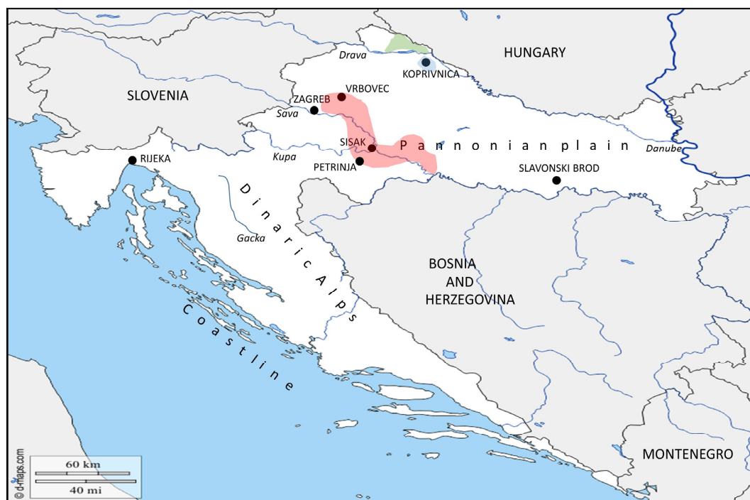
Figure 2. Natural foci of tularemia in Croatia. Three main natural foci of tularemia in Croatia according to Borčić's 1974 study were determined. The greatest natural foci were situated along the middle course of the river Sava, in the region called Middle Posavina (red colour), and in two smaller areas located in Međimurje, northeastern Croatia (green colour) and around the city of Koprivnica (blue colour), nearby river Drava. Names of the cities and countries are labelled with upper case letters. Names of the three ecological regions are labelled with lower case letters. Names of the rivers are labelled with lower case letters and italic.