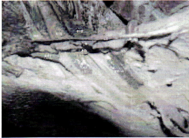
Fig. 1. Photography of the right side of the specimen show the femoral triangle with the origin of the obturator artery and termination of the obturator vein.

only one obturator vein and it is parallel to the OA and in front of the OA. The obturator vein ends into the femoral vein from the front, at 1.5 cm lower level than is the origin of the OA. The calibre of the OA and OV is 3.5 mm. During the dissection of the blood vessels of the left part of the pelvis we found the regular anatomical pattern.