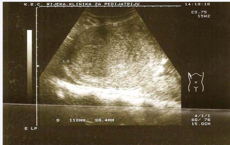
Figure 1 Abdominal ultrasound suggestive of heterogeneous liver lesion, measuring 12x8 cm.

The girl is regularly followed-up clinically and with imaging studies. Seven years after the diagnosis she is in complete