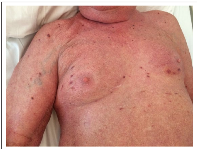
Figure 2. Bluish and indurate lesions on upper trunk.

38.6 \times 10^9/L , and lymphocyte 32.4 \times 10^9/L with Gumprecht shadows present. Abdominal ultrasonography did not show a large spleen or enlarged lymph nodes. The patient was seronegative for HIV and hepatitis B and C. Regular hematological checkup was indicated. Systemic therapy with antihistamines and corticosteroids led to major regression of dermatological symptoms. Multiple papules persisted. Initial differential diagnosis included angioma, pigmented purpuric dermatosis, hemangioendothelioma, and KS. Two papules from the lower leg and trunk were excised and sent