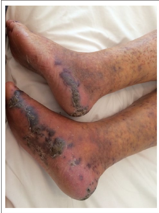
Figure 1. Purplish hyperkeratotic plaque.