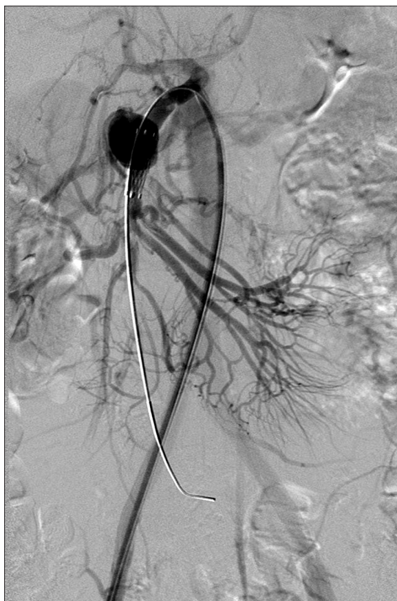
Figure 2. Control DSA showed persistent aneurysmal sack filling after implantation of self-expandable covered stent due to incomplete aneurysmal neck covering.

expandable cobalt-chromium covered stent (E-ventus BX ® , Jotec, 8×50 mm) was placed in the SMA, covering the aneurysmal neck (Figure 3). A control DSA confirmed a complete exclusion of the aneurysm.