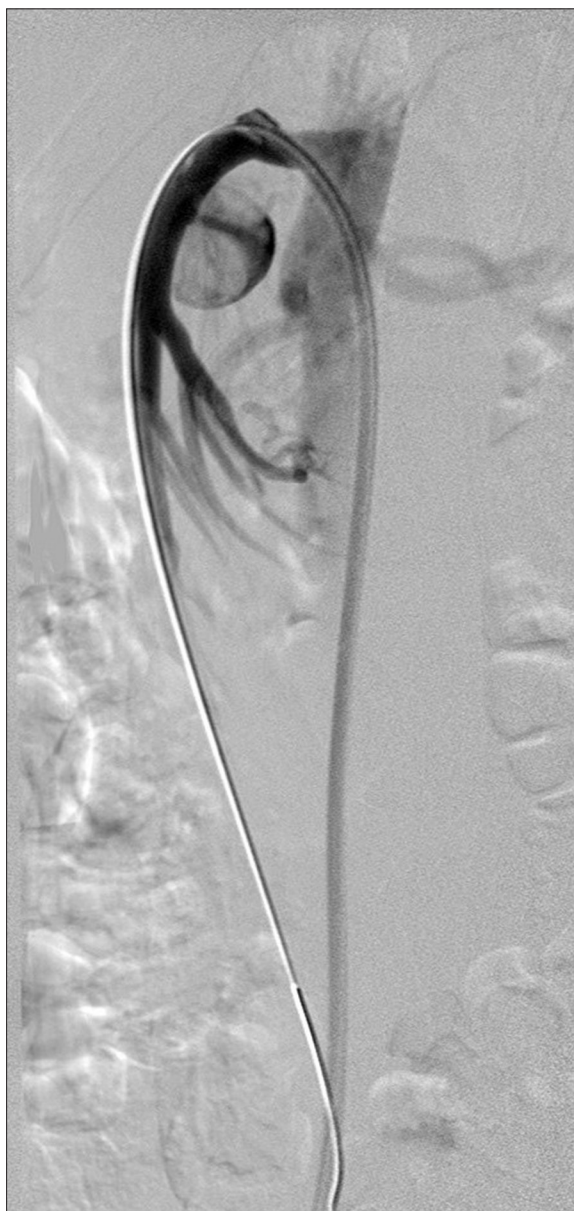
Figure 1. DSA confirmed aneurysm originating from the proximal part of SMA.

Due to a large size of the introducer sheath (9 Fr), required for the available covered stent implantation (Bard, Fluency®, 8×20 mm), the femoral approach was chosen. Digital subtraction angiography (DSA) confirmed previous findings (Figure 1). Selective SMA catheterisation was performed with the use of a curved guiding catheter and a stiff guidewire (Amplatz stiff®, Cook) that was placed distally in a branch of the SMA. Heparin (5000 IU) was administered into the SMA. An introducer sheath (9 Fr, 55 cm, Brite tip®, Cordis) was advanced into the SMA ostium and a self-expandable covered stent was implanted. A control DSA showed persistent aneurysmal sack filling (Figure 2). Single femoral approach, a stiff guidewire and a large sheath distorted the anatomy, resulting in an incomplete aneurysmal neck covering. Alternatively, only a rigid, stainless steel covered stent was available and therefore the procedure was terminated. The patient was discharged from