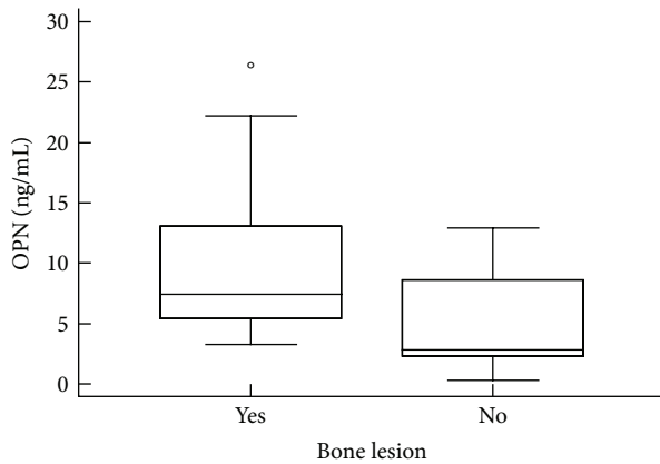
FIGURE 2: Comparison of plasma OPN levels between patients with bone disease and those without manifest bone lesions. The plasma concentrations of OPN were significantly higher in patients with bone disease ( P = 0.03 , Mann-Whitney U test). The upper and lower borders of the box indicate the 75th and 25th percentiles, respectively, and the line in the box represents the median. The ends of the whiskers represent the minimum and maximum of all of the data excluding outliers. Outliers are plotted as individual points.

cytokines with the most common presenting symptoms of MM (e.g., anemia, renal insufficiency, and bone disease), as well as with routine prognosticators beta-2 microglobulin and Durie-Salmon clinical stage, which reflect tumor burden.