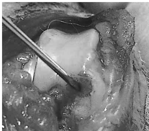
Fig. 1. Articular defect formed by chisel was drilled with K-wire till the subchondral bone.

The knee joint of each sacrificed animal was opened and the femur dislocated from the tibia. The distal part of the femur was excised and rinsed with saline, fixed in