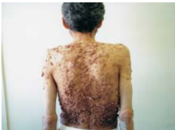
Figure 2. Patient with neurofibromatosis. The entire trunk is covered with cutaneous tumors.

side, cough, dyspnea, fever, and weight loss. His past medical history included congenital deformation of the right foot. Skin macular pigmentation and neurofibromas, first observed at the age of 13, increased in number and size. His mother, aunt, and grandfather from the mother's side, had similar skin changes, but smaller and fewer. His uncle underwent a surgical treatment for kidney polycystosis, whereas his sister has kidney cysts and her daughter a polycystic ovary (Fig. 1). Proband's mother and aunt, both with neurofibromatosis, had surgically treated myoma and stomach carcinoma, respectively. At physical examination, the patient showed multiple neurofibromas and café au lait spots (Fig. 2) covering the whole body, particularly the trunk. The right tibia was 8 cm shorter than the left one, with hypotrophic musculature, and the right ankle was deformed, with 0 degrees of flexion and 15 degrees of extension.