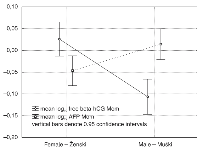
Figure 2. Mean \log_{10} MoMs of amniotic fluid free \beta -hCG and AFP according to fetal gender

Slika 1. Srednja vrijednost \log_{10} MoM slobodnog \beta -hCG i AFP u plodovoj vodi ovisno o pušačkom statusu trudnice