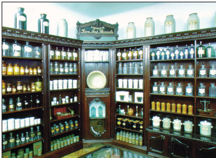
Figure 4 Historical pharmacy items