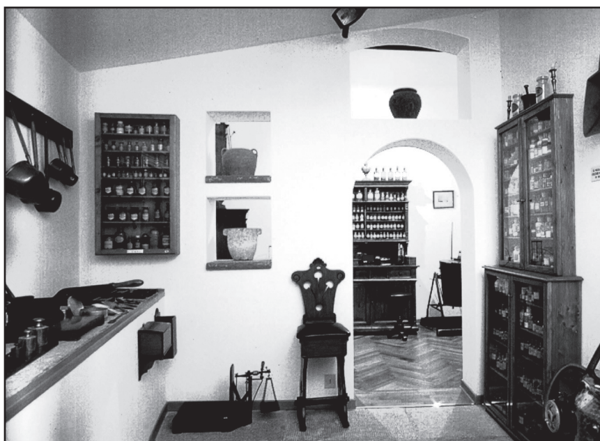
Figure 3 The Picciola pharmacy museum