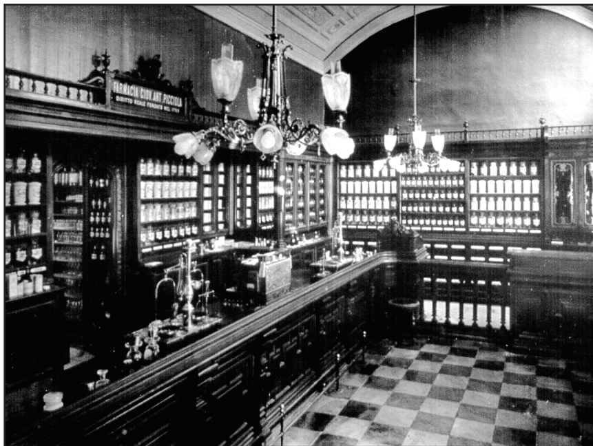
Figure 2 The interior of the Picciola pharmacy after the restoration in 1907

Slika 2. Unutrašnjost ljekarne Picciola nakon obnove 1907.