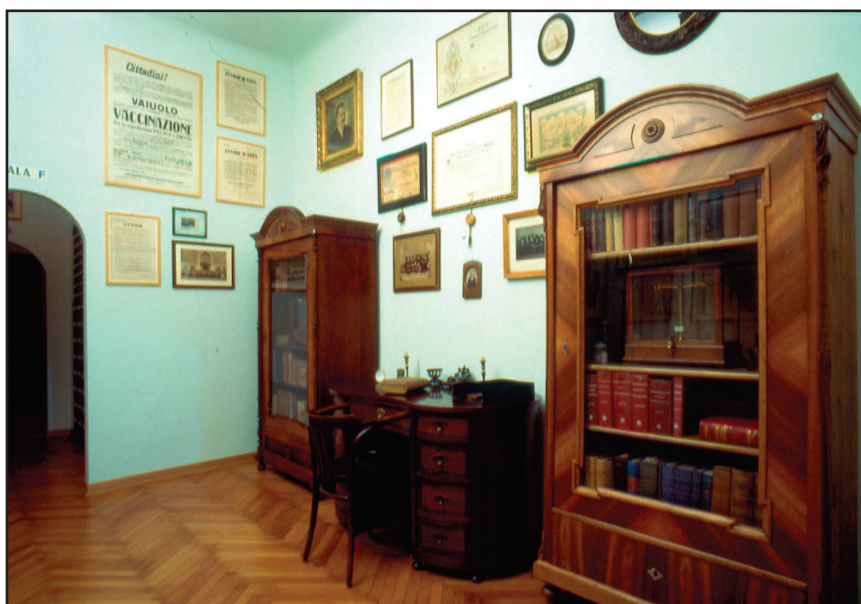
Figure 5 Furniture across history