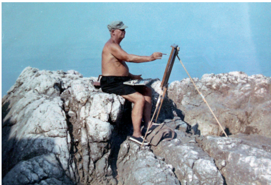
One of the pleasant days in retirement, behind the easel at the seaside on the island of Krk

Even though he had published a few notable early papers before WW2, his scientific career peaked in the postwar period. His opus includes fifteen notable research and professional papers, and shows a wide spectrum of interest in infectious diseases and contiguous areas of research, from classical infectious diseases to new epidemics and novel solutions - often his