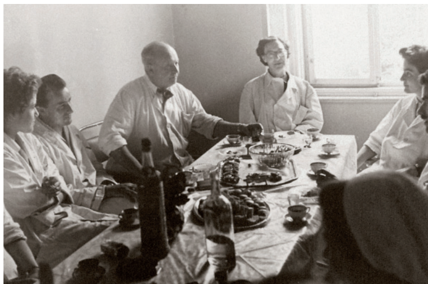
At the Clinic for Infectious Diseases with his colleagues on the eve of retirement in 1968