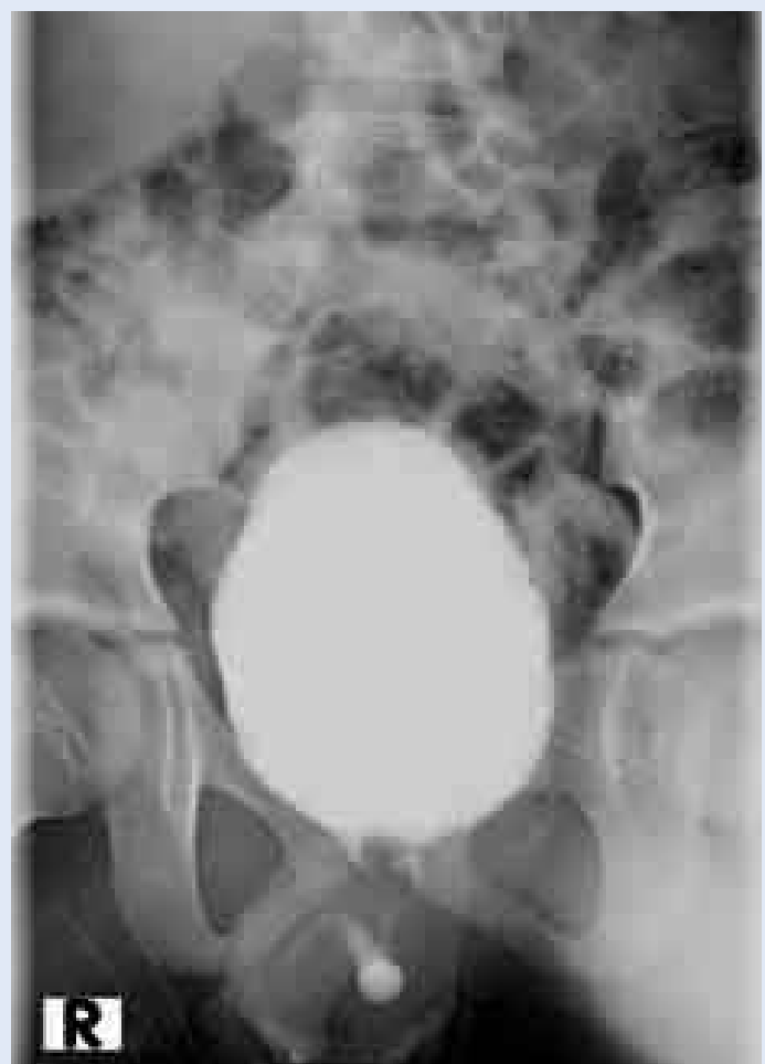
Figure 1. VCUG showing the filling defect at the base of the bladder and in the prostatic urethra. Very thick contrast passage can be seen from the bladder to the anterior urethra.

The case presents an unusual manifestation of urethral polyp projecting from verumontanum into the bladder cavity. Although the diagnosis can be made by US, VCUG and MRI, only urethrocystoscopy has a major diagnostic and therapeutic value especially in boys presenting with urine retention.