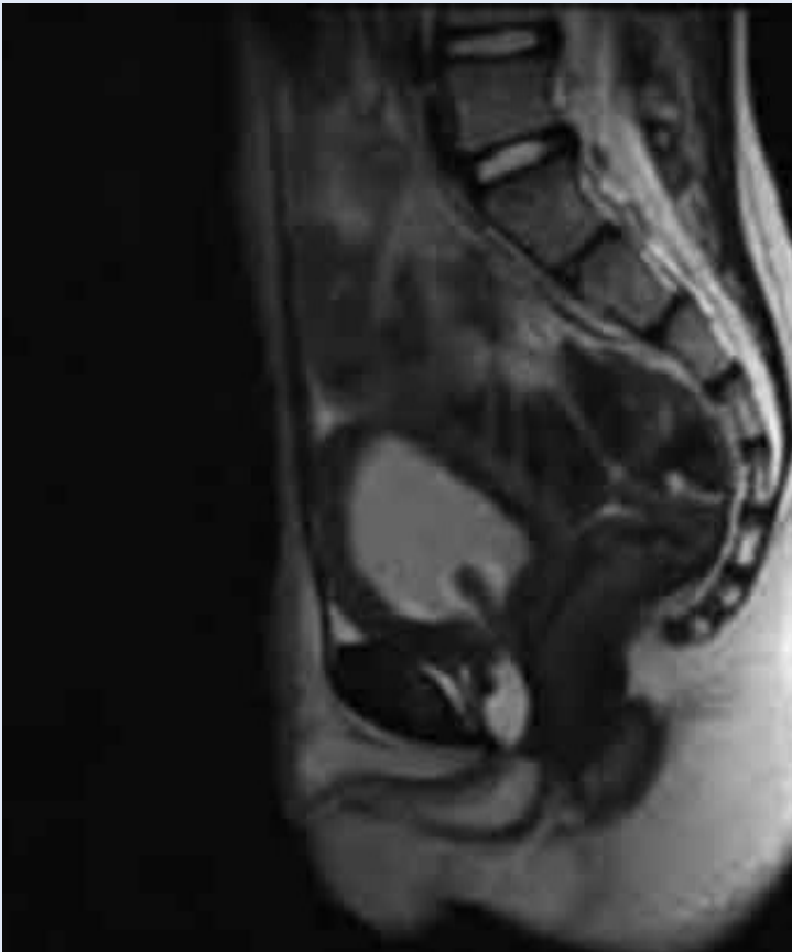
Figure 2. MRI showing the well-circumscribed polypoid lesion (2x1 cm) with low signal intensity, arising from the posterior urethra, passing through the bladder neck and entering the bladder inner space.